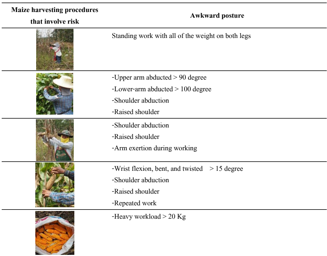
Table 3 The criteria according to the working postures characteristics which are at risk in harvesting process