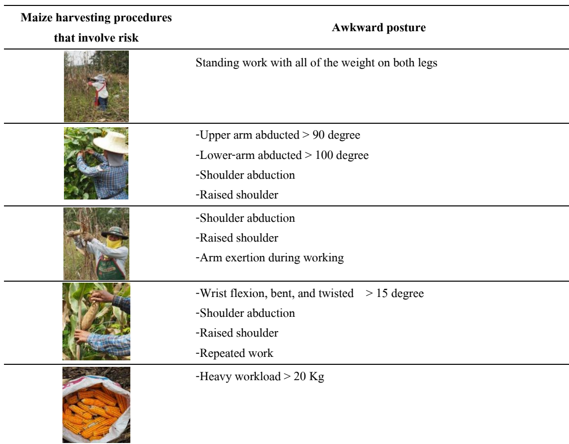
Table 3 The criteria according to the working postures characteristics which are at risk in harvesting process